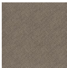
Warm Intentions 77761