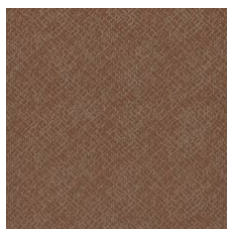
Adventurous Spi 77665