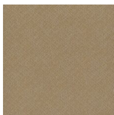
Humble Beginnin 77155