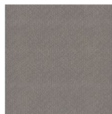
Major Milestone 77515