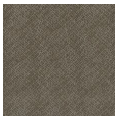
Express Gratitude 77740