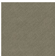
Enriched Wisdom 77330