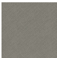
Self Reflection 77484